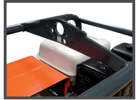
'PATENT PENDING' SINGLE POINT LIFTING