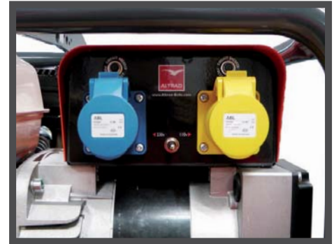
DURABLE SCREW-IN SOCKETS & METAL COVERED FUSE BOX