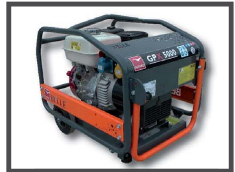
WHEELED GPX 5000 VERSION AVAILABLE